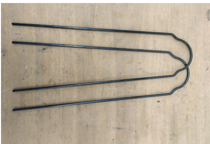
1/ 2 fixing rods