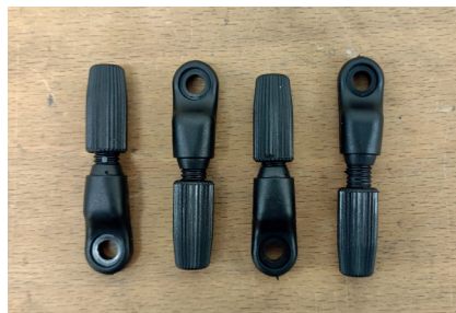
2/ 4 rod end caps