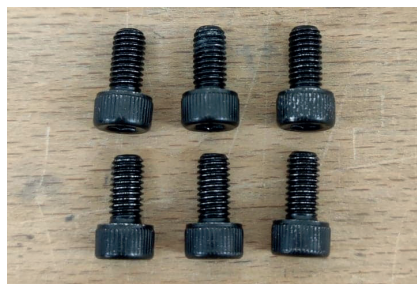
5/ 6 M5x10mm screws