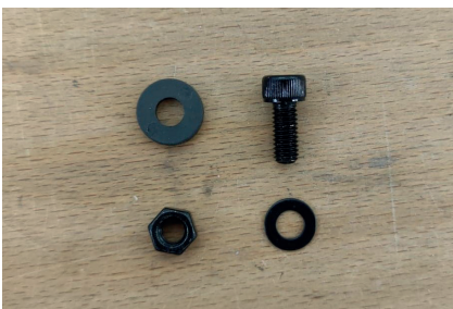
4/ Spacer, M6x15mm screw, M6 nut, M6 washer