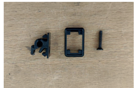
3/ Set of rod ties (x2 in the kit)