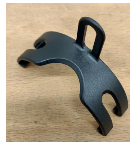
6/ Rear mud guard hook